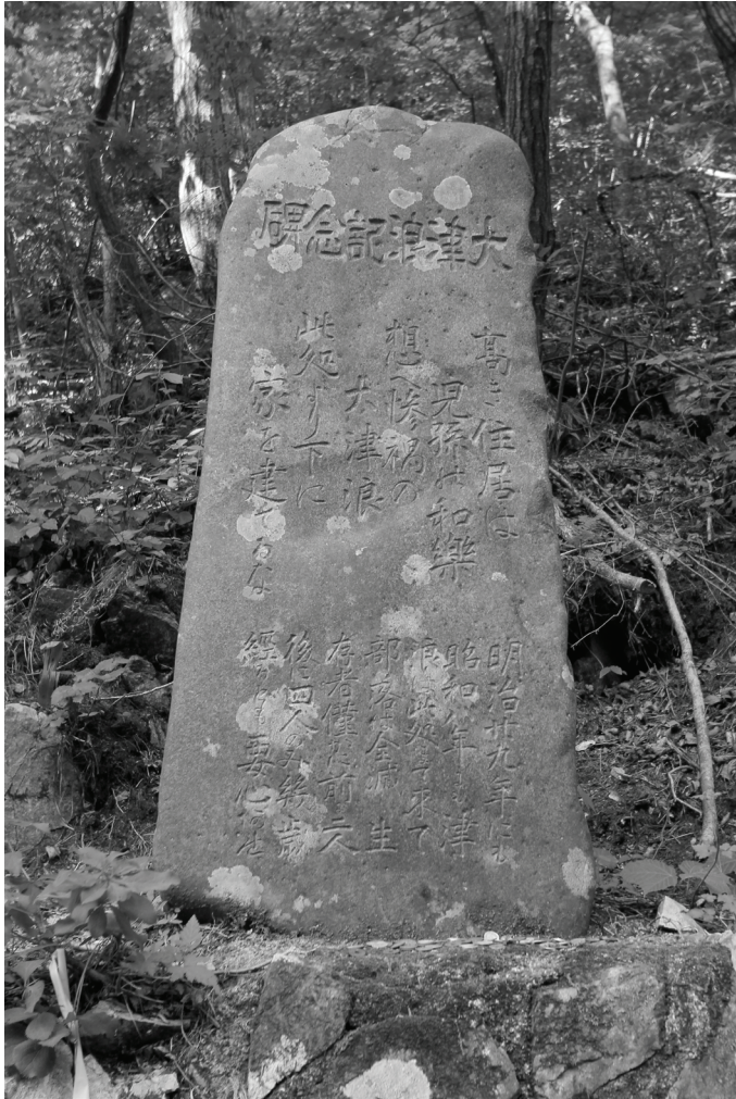
Figure 2. Aneyoshi Tsunami Stone. “The homes on higher places will guarantee the comforts of the descendants, Remind the horror of the tsunamis, do not build homes below this point. We suffered tsunamis in 1896 and also in 1933, only two villagers... survived [sic].” Photo taken June 14, 2013.