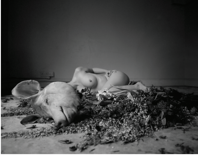
Figure 10: Sophia Schorr-Kon, Delphine's Call , 2012.

Goneril's argument against wasteful domestic management. 52 In this context, Lear's own defense of this lifestyle seems deliberately tuned to a logic of excess, as its prickly tone and outrageous analogies is one with the excessive scale of the class it means to defend: