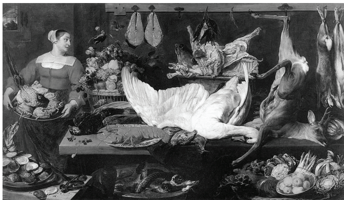
Figure 9. Frans Snyder, The Pantry , 1640.

the genre progressed, the medieval symbol of the skull as momento mori was inserted on these tabletop renderings to remind the reader of the obvious. From our vantage point, the interest is in the careless expenditure signified in the image of the discarded food as a vision of wasted beauty, an undervalued but aesthetically rich item now meant to signify through the translation of the decadent natural hues a newly discovered courtly dissipation (fig. 8).