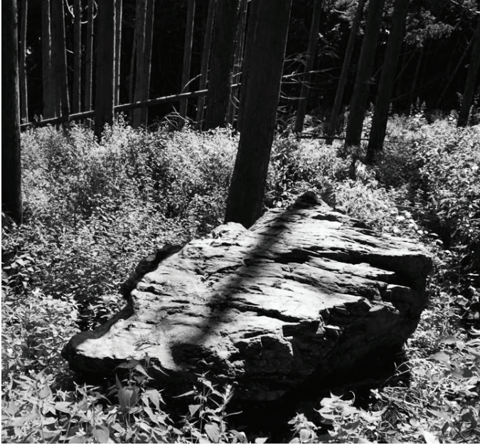
Figure 3. Tsunami stone of Attari.

Photo taken September 12, 2015.