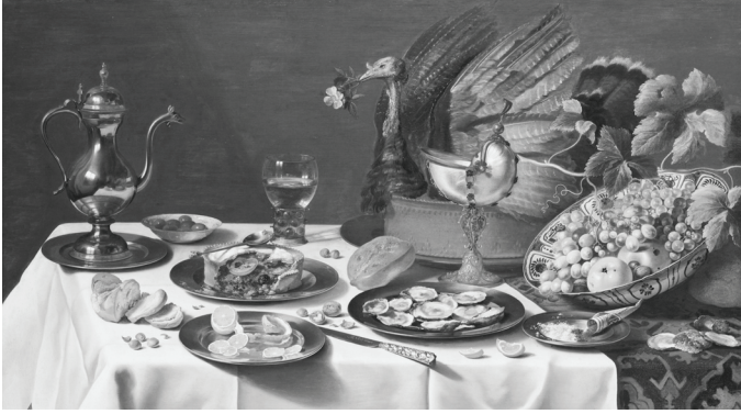
Figure 8. Pieter Claesz, Still Life With a Turkey Pie , 1627.

Albala never shifts his attention from cookbooks and dining guides, but he does reference comparable aesthetic styles of poetry and painting in the “baroque” attention to fine detail of the presentation of the food, “much like the attention to lavish ingredients used in baroque architecture: colored marble, and especially gold and silver ... [were both used] in decoration of building and food.” 38 The central dishes presented in each course are huge tableaux vivants of one main ingredient surrounded by a profusion of garnishes. “There is still,” he concludes, “far too much food for mortals to consume, and it is still served on a monumental scale.” 39