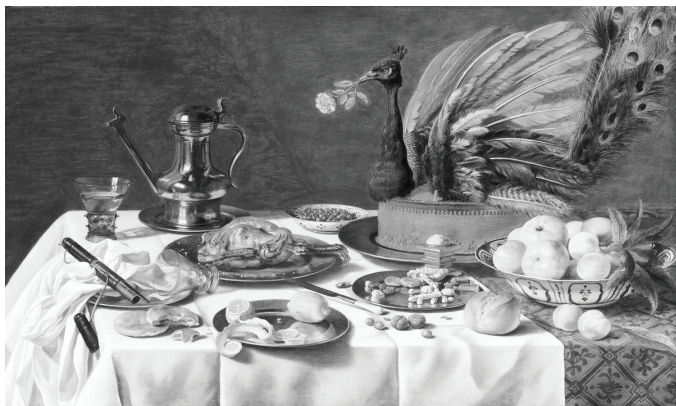
Figure 7. Pieter Claesz, Still Life With a Peacock Pie , 1627.

ferred the bounty of gifts (food, furnishing, and service) the sum of whose conspicuous value would symbolize the king's beneficence. Goneril's complaint could be directed at the long history of Tudor and Stuart court extravagance, if we remember the stories of Henry VIII's first colossally wasteful court, whose scale of improvidence is beyond the pale even by today's standards. Henry Tudor had to leave Hampton, as legend has it, because his kitchen routinely denuded the surrounding countryside of its livestock, fruits, and vegetables to feed his guests. 21 One of the "lost practices" of the feudal age is courtesy , the liberal spending of the gentle classes. Lawrence Stone calls this the "acid test" of aristocratic identity: "Money was the means of acquiring and retaining status, but it was not the essence of it." He explains, "[T]