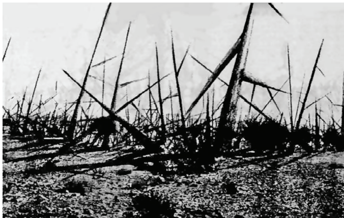
Figure 6. Proposed image for “Landscape of Thorns.”