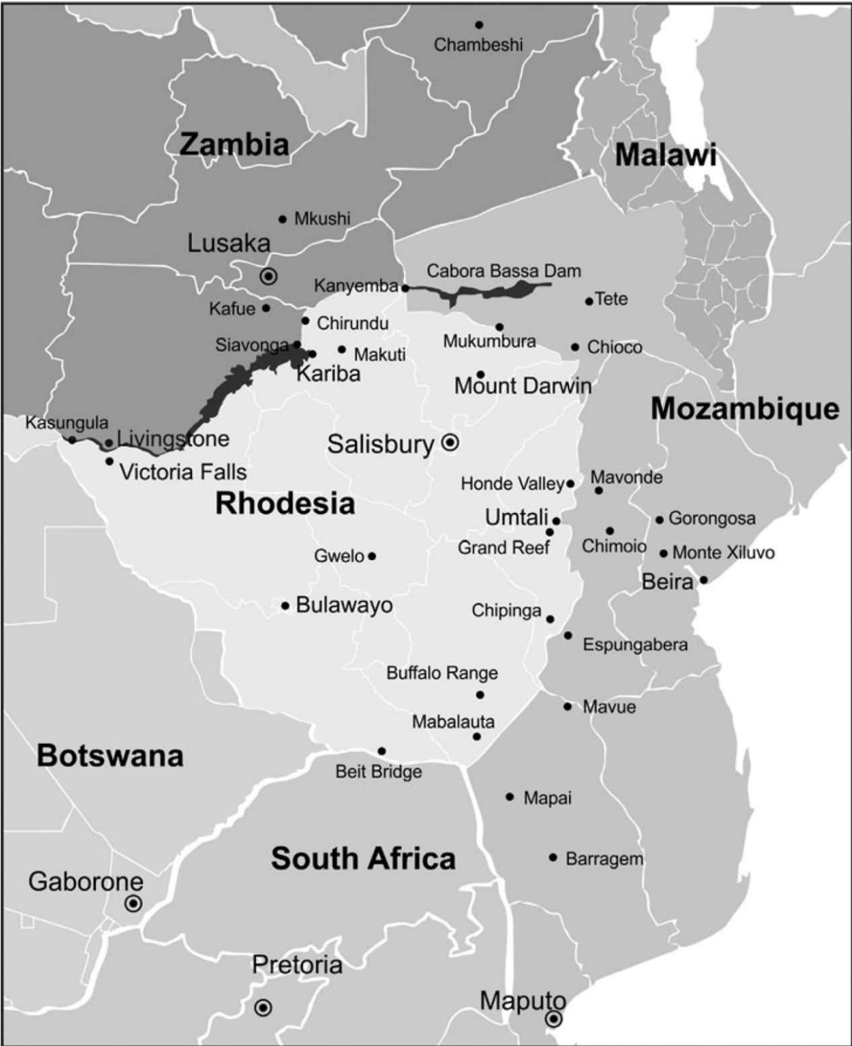
Points of Operational Significance