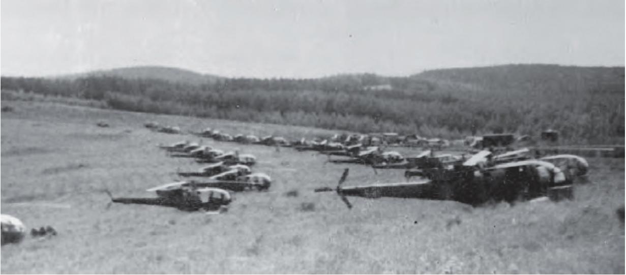
Choppers ready for raid into Mozambique.