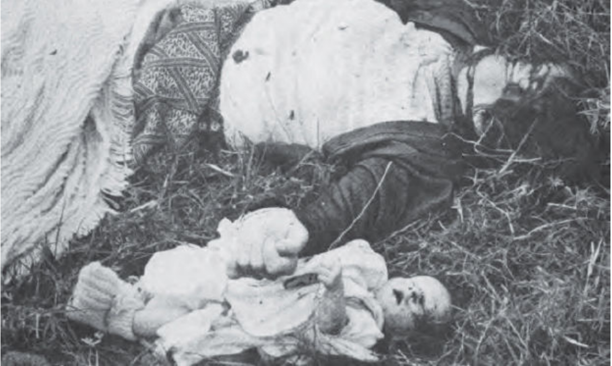
Mother and child slain at Elim Mission.