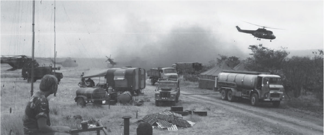
Choppers on their way to Barragem.