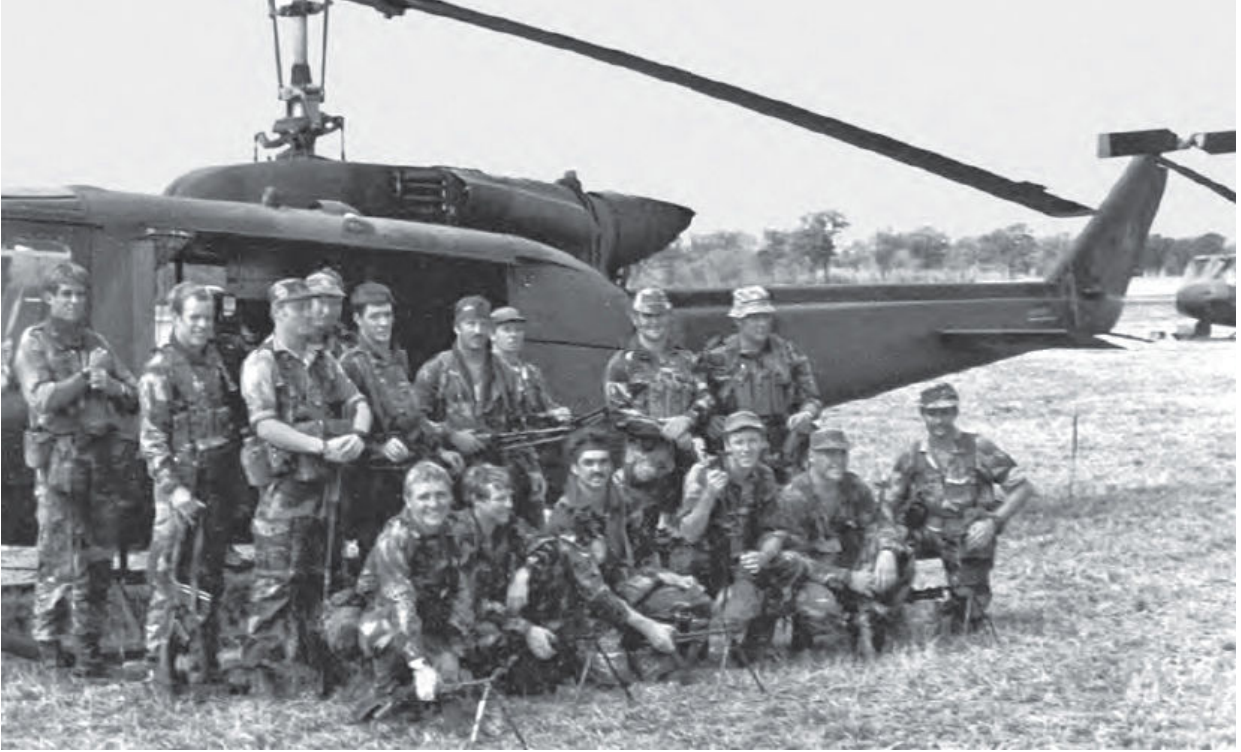
Watt's men before bridge-blowing operation.