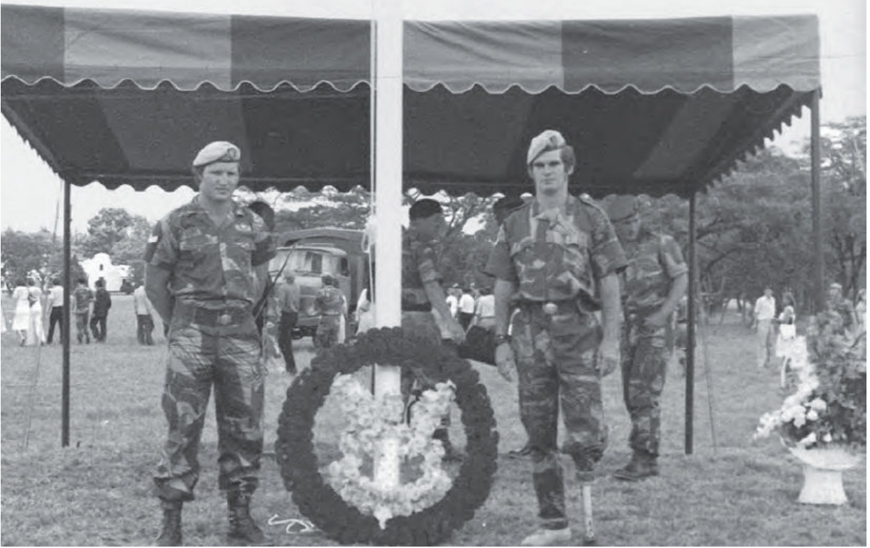
Final ceremony; the end of the Rhodesian SAS.