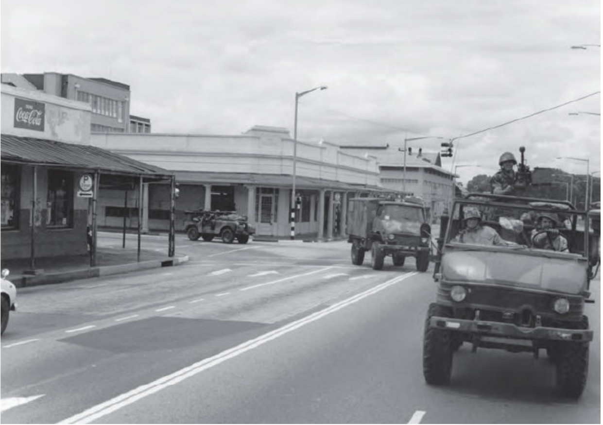
SAS prowl the streets of Salisbury looking for the trouble that never came.