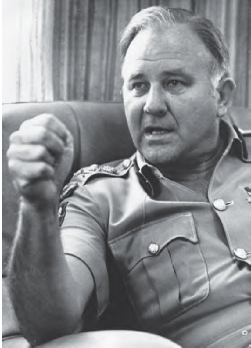
Rhodesian military supremo General Peter Walls.