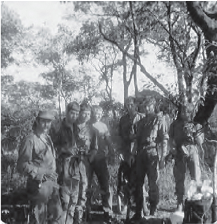
Watt's men in southern Mozambique.