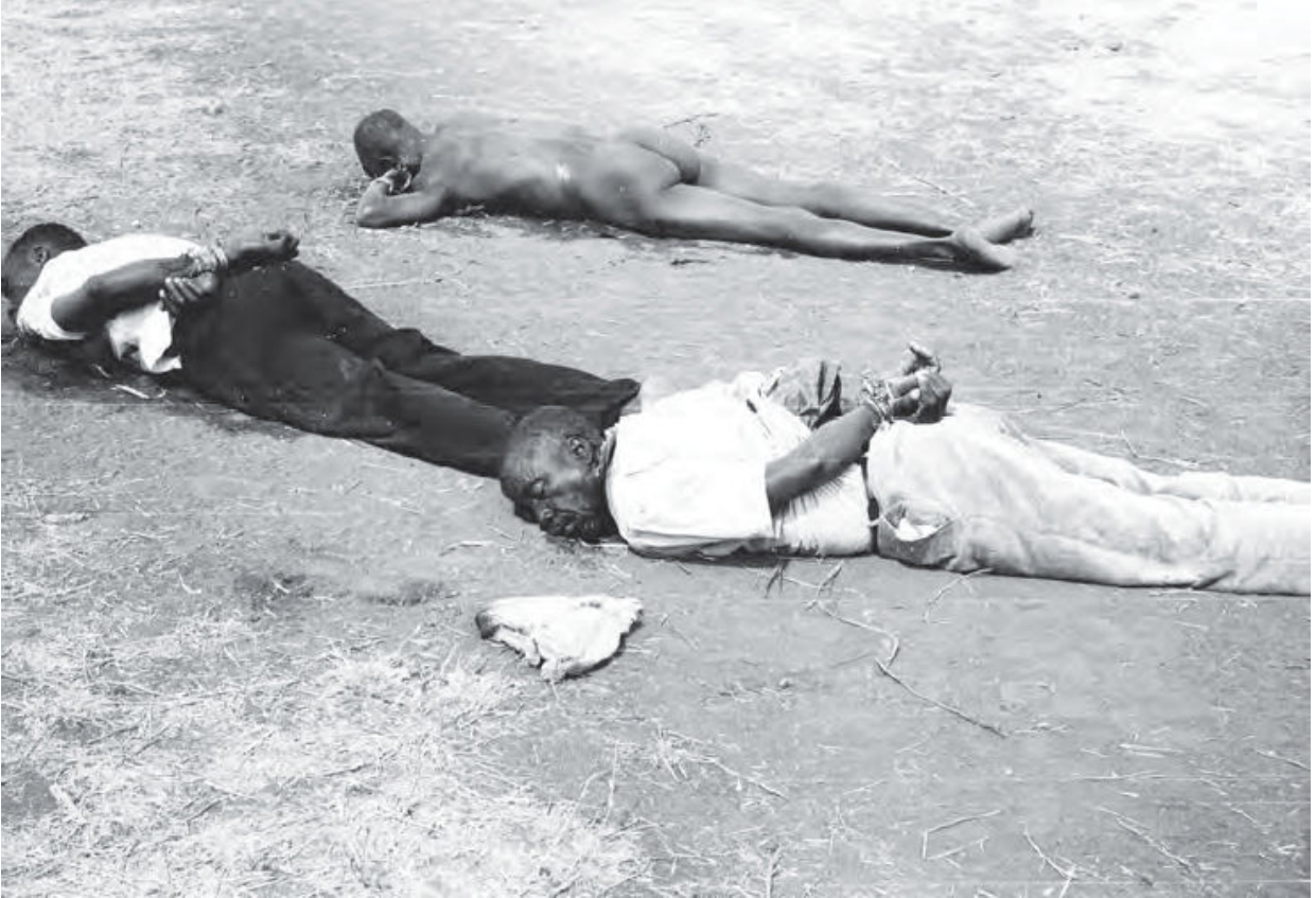
Suspected collaborators murdered.