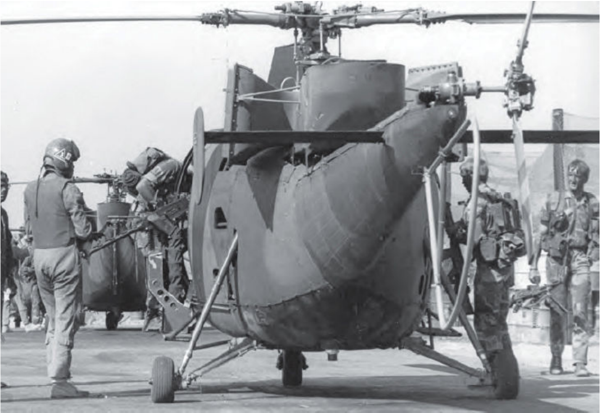
RLI Fire Force preparing for uplift.