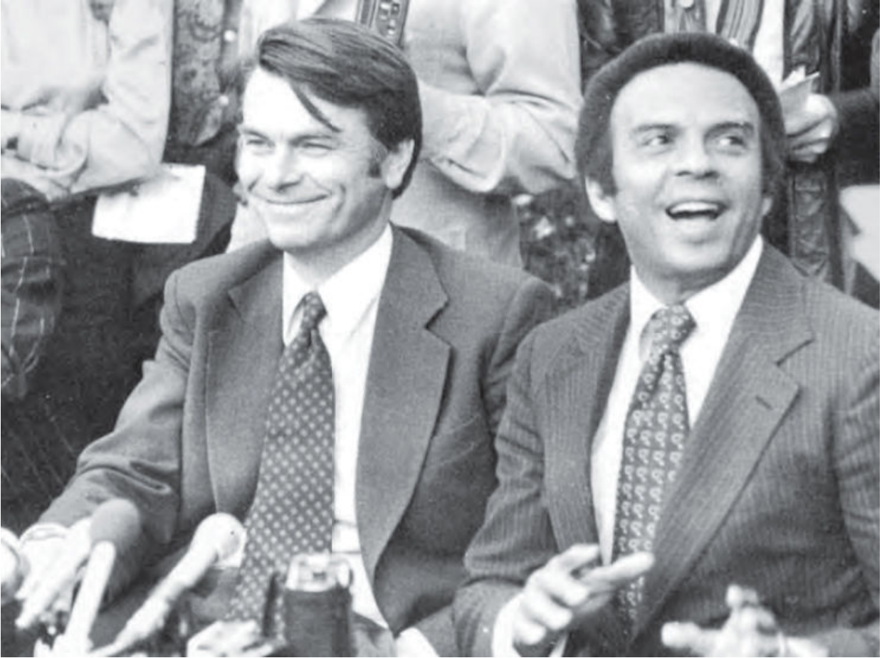
British Foreign Secretary David Owen and Andrew Young, Jimmy Carter's UN Ambassador.