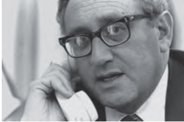
US Secretary of State Henry Kissinger; tried hard to end the war and earned Ian Smith's respect.