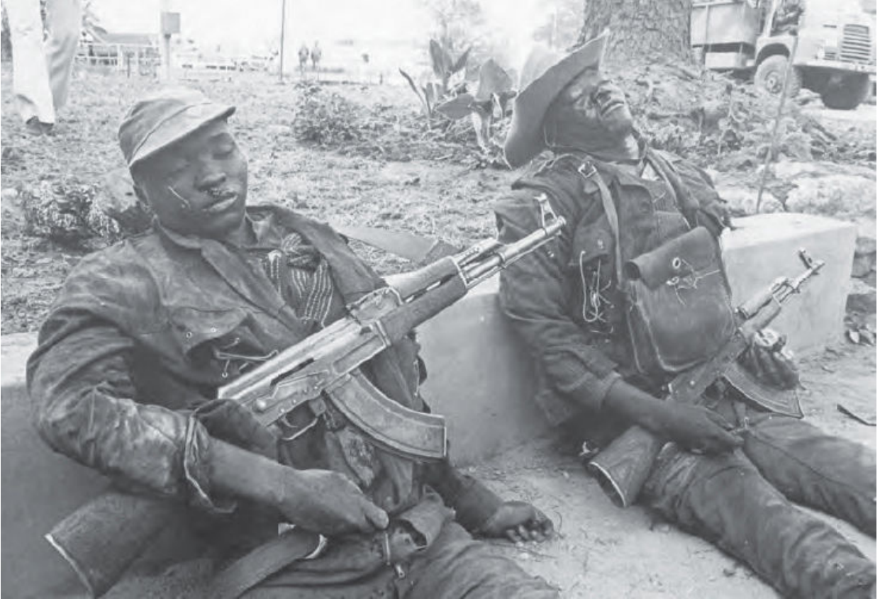
ZANLA men killed in the north-east of the country.