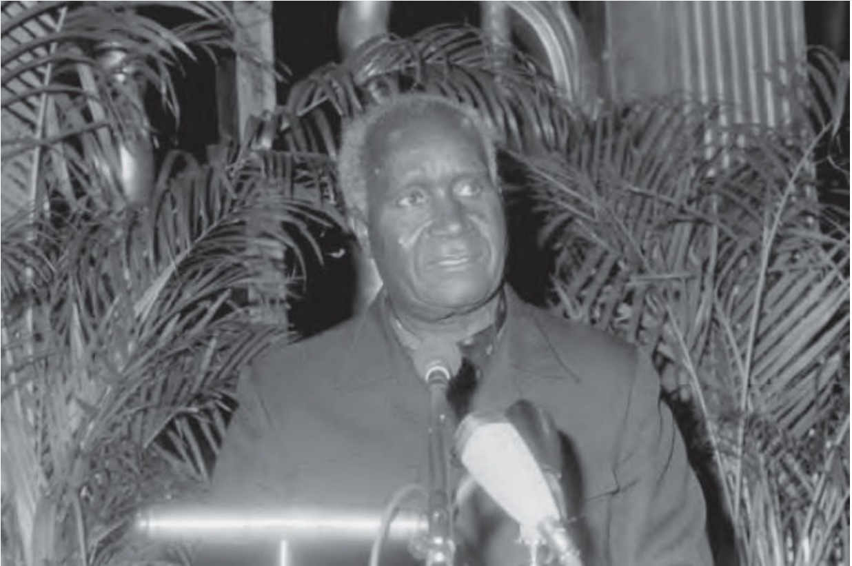
Zambian President Kenneth Kaunda.