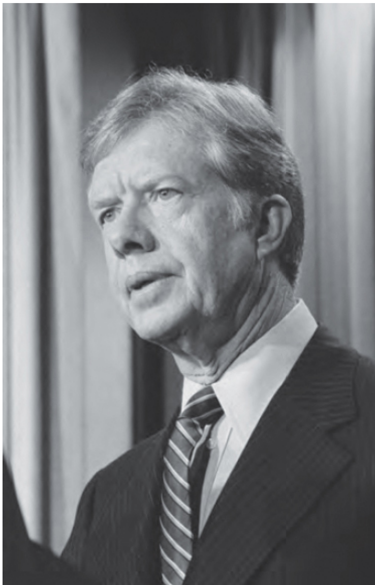
US President Jimmy Carter; determined to use US power to end white rule in southern Africa.