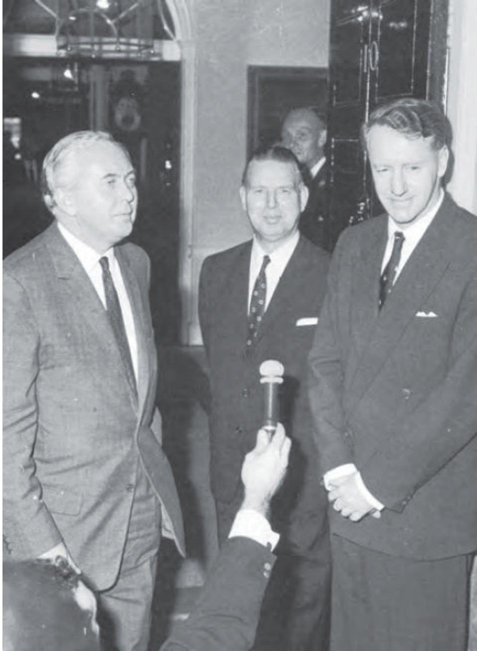
Ian Smith, Prime Minister of Rhodesia (right), and British Prime Minister Harold Wilson (left), 1965.