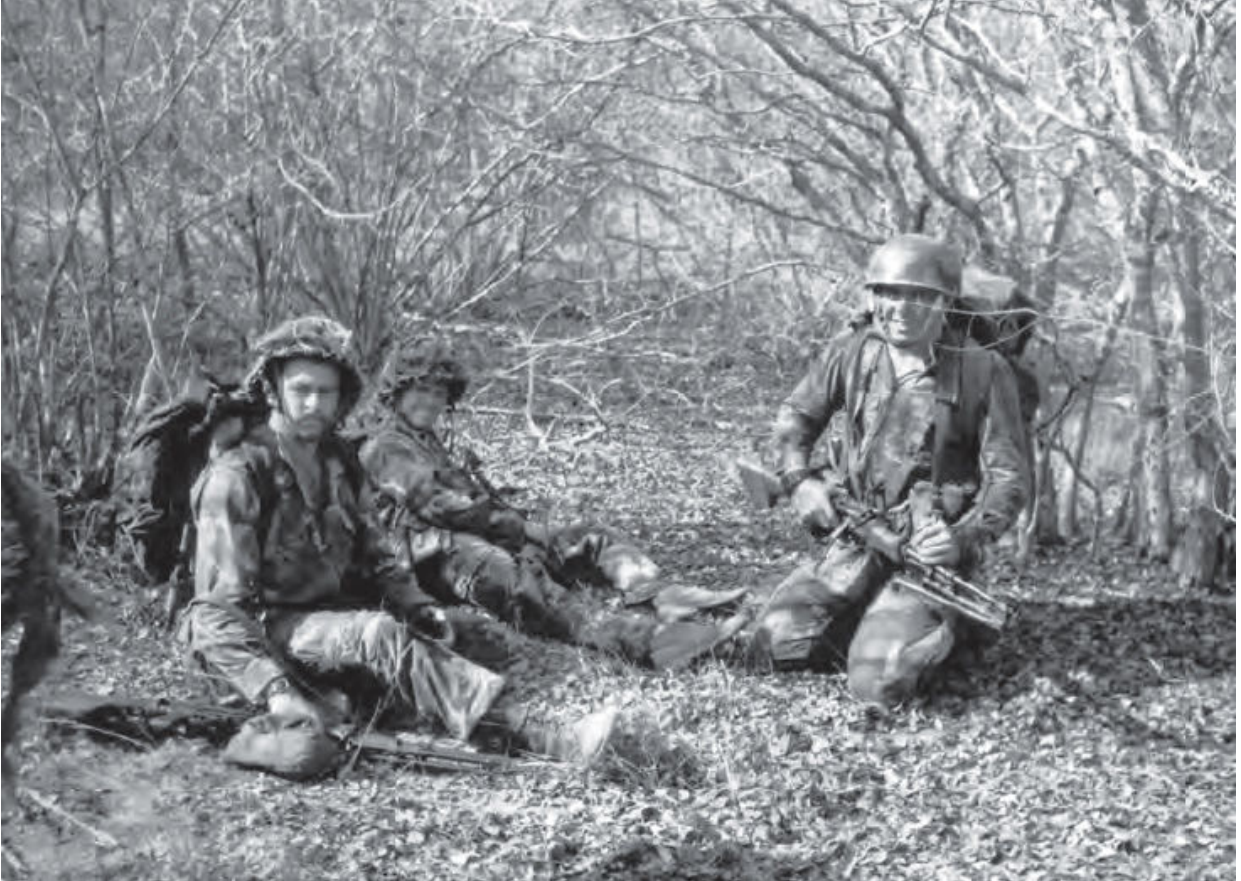
SAS men resting after attack on Barragem.