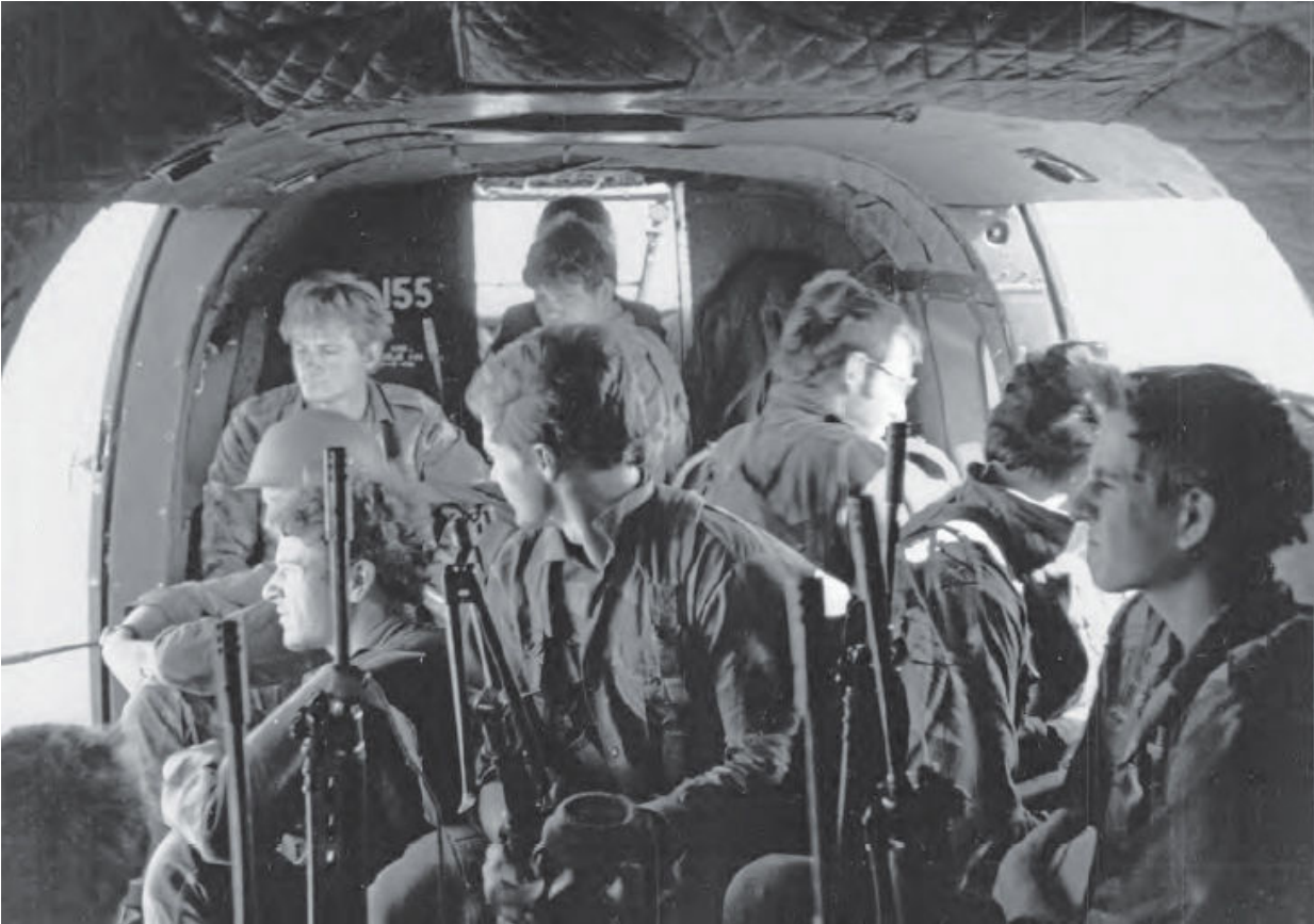
Pensive troops ready for battle.