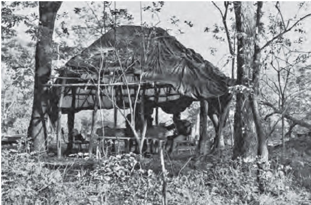
Darrell Watt's headquarters in southern Mozambique.