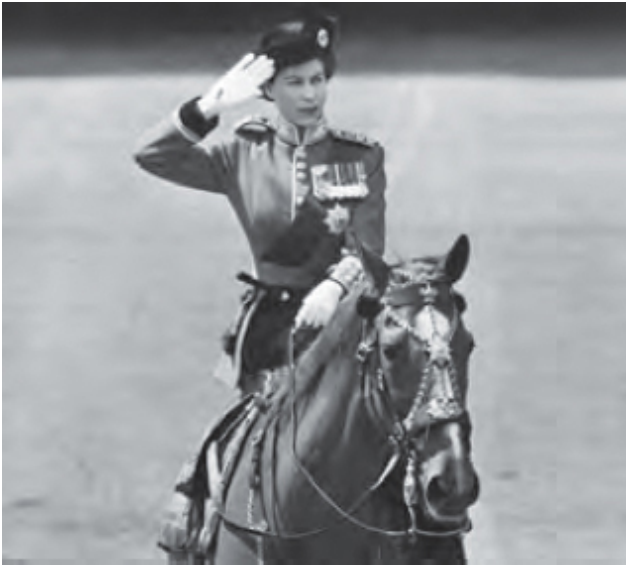
Queen Elizabeth; played a pivotal role in bringing Mugabe to power.