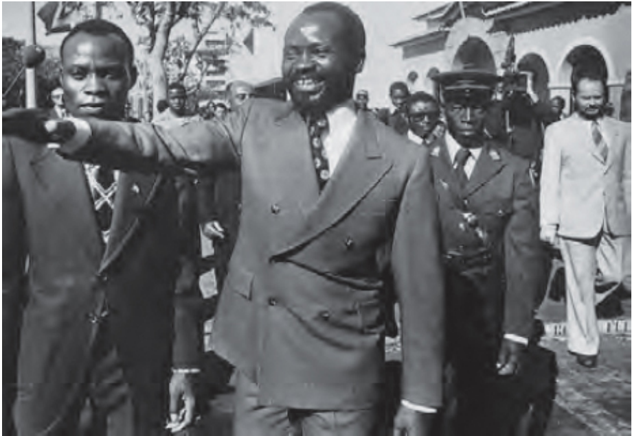
Mozambican President Samora Machel; severely pressured by the SAS.