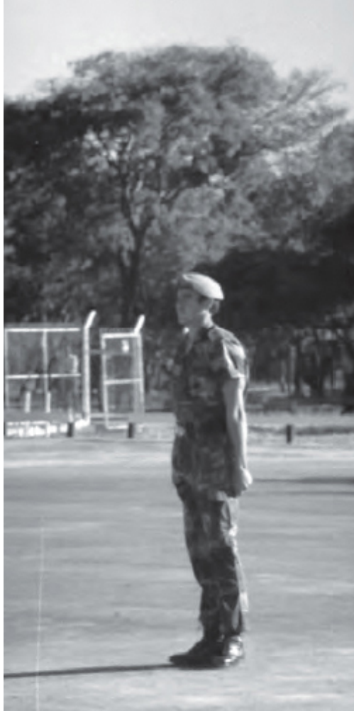
Scheepers about to be awarded 'Wings on Chest' by General Maclean.