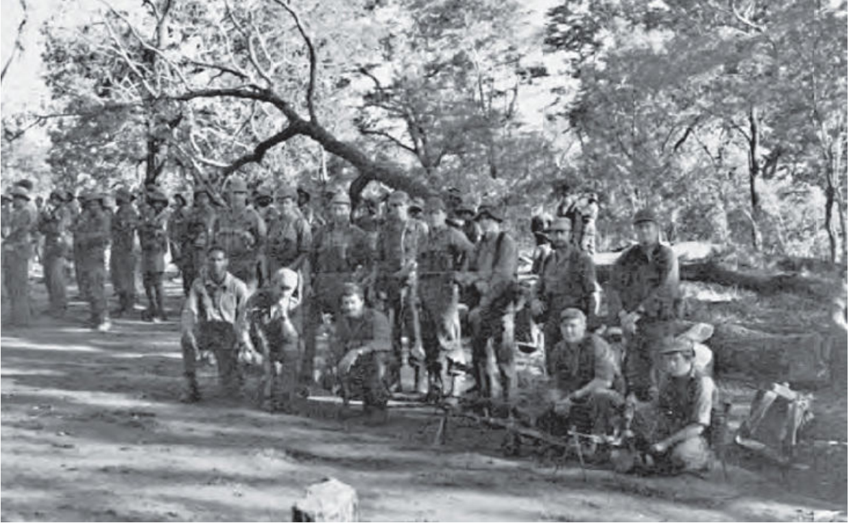
SAS men and their Renamo allies.