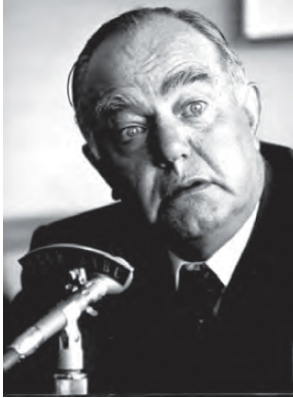
South African Prime Minister John Vorster; used Rhodesia as South Africa's sacrificial lamb.