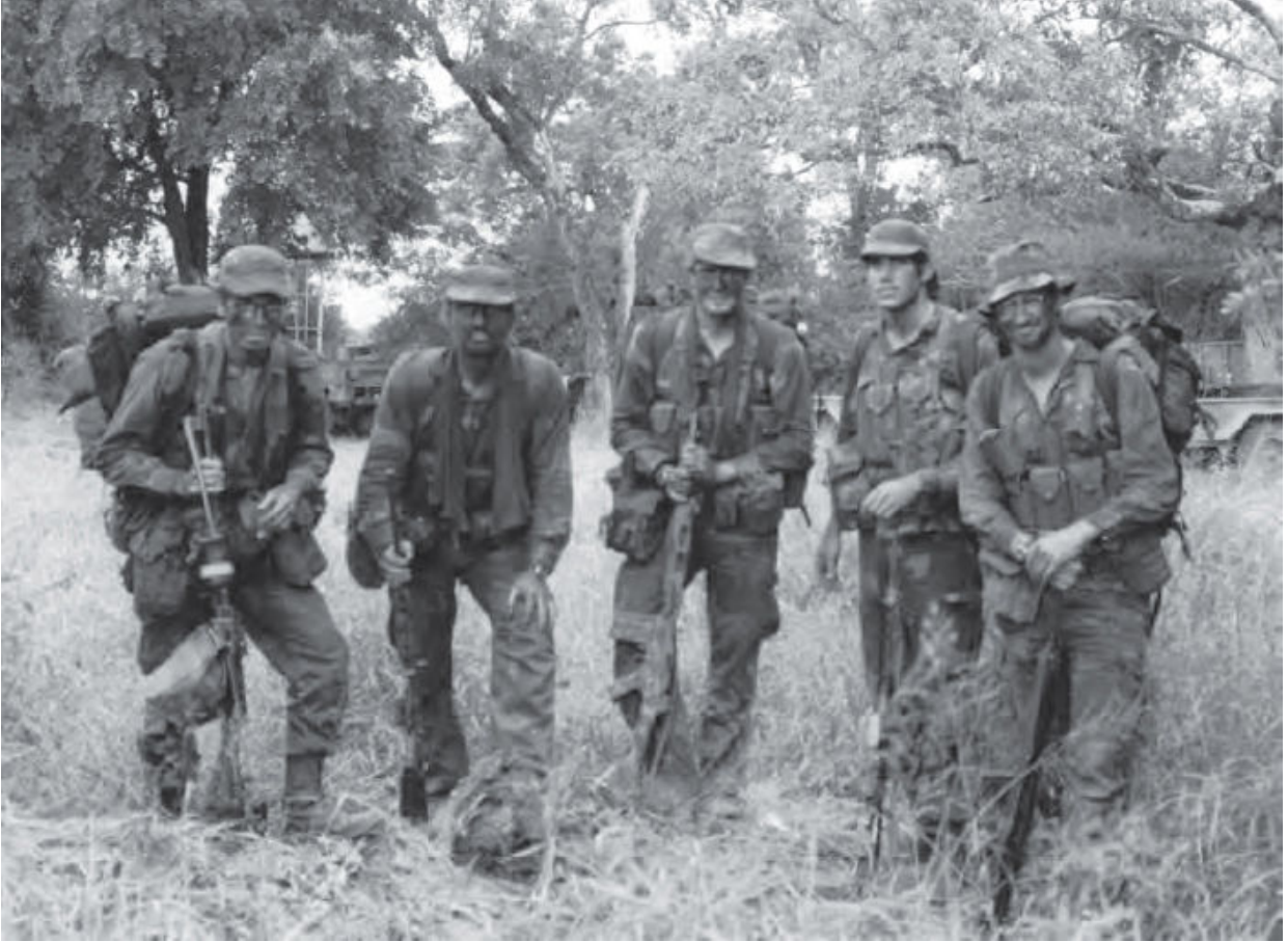
SAS operators ready to roll.