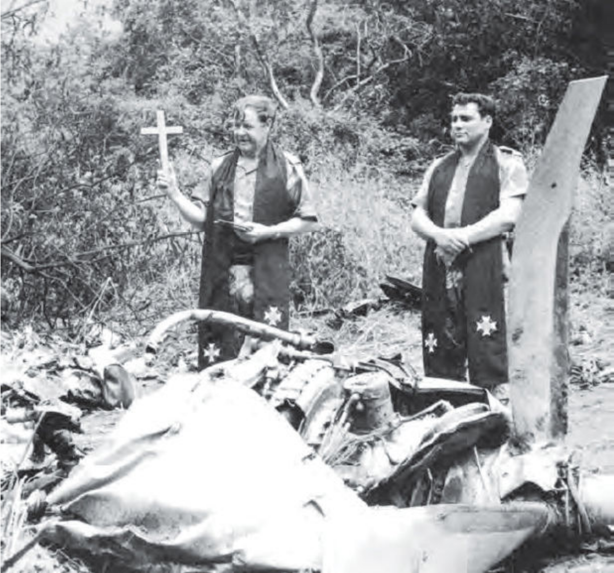
Consecration service at the wreckage of the 2nd Air Rhodesia Viscount airliner shot down by Zipra.