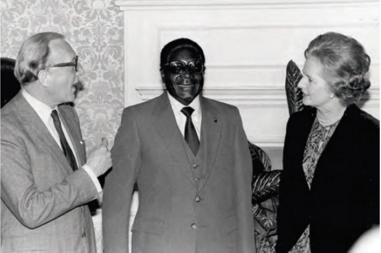
Foreign Secretary Carrington, Robert Mugabe and Prime Minister Margaret Thatcher. Ian Smith described Carrington as 'the most evil man I ever met.'