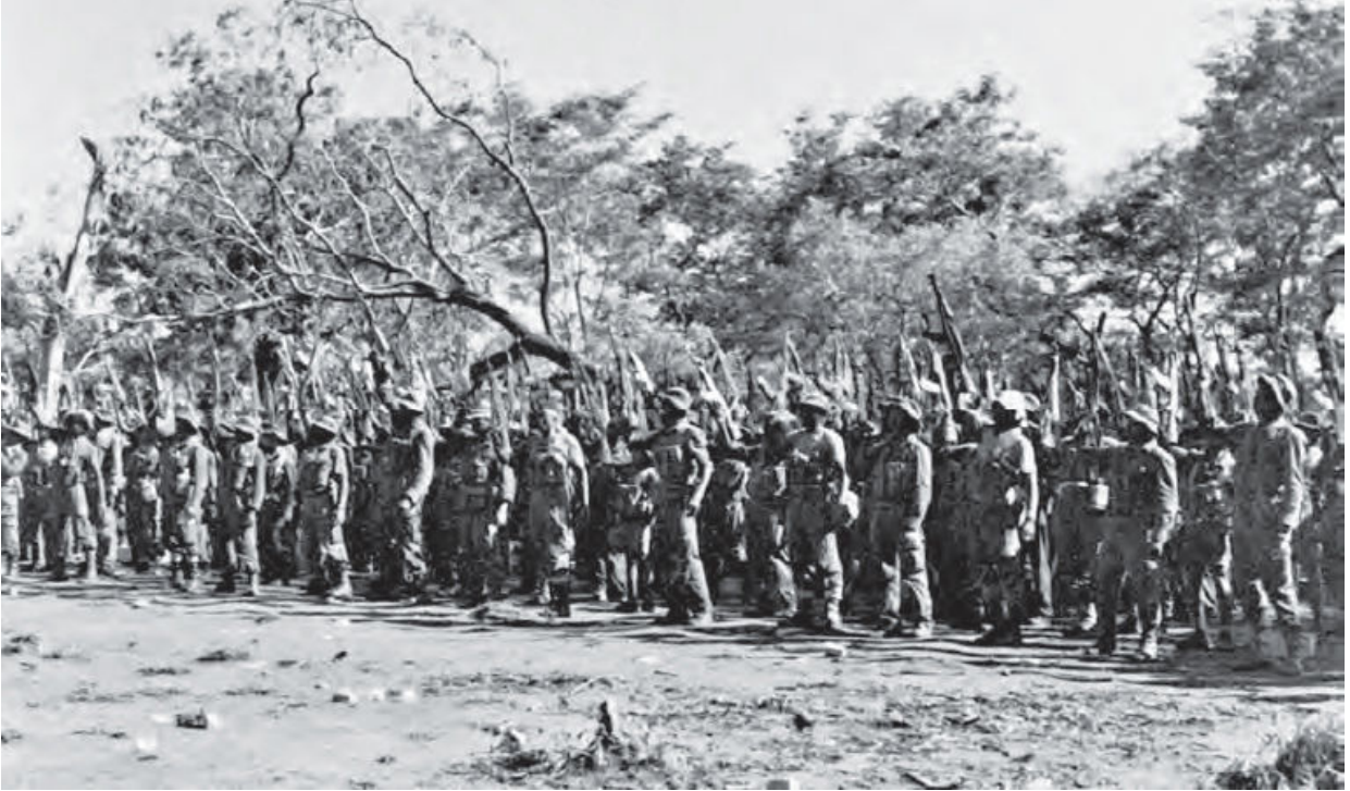
Renamo fired up!