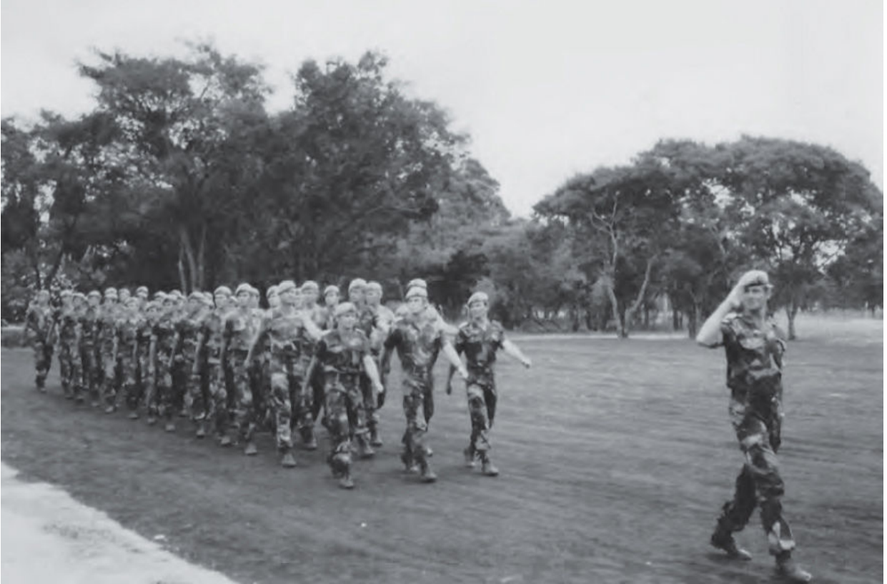
SAS on parade.