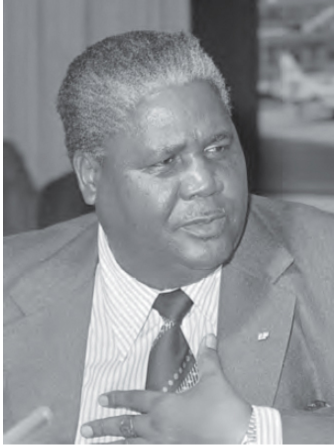
Joshua Nkomo; took responsibility for the downing of the Viscounts.