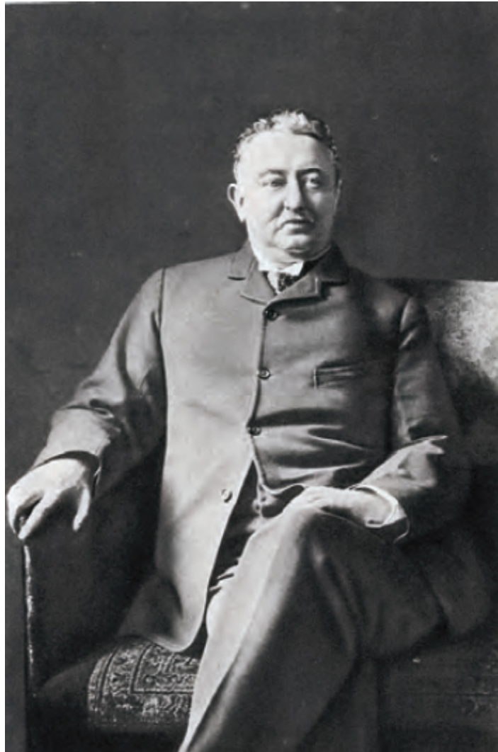
Cecil Rhodes; planted the seed of conflict.